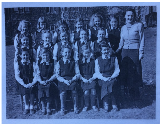
Form 11B, late 1940s