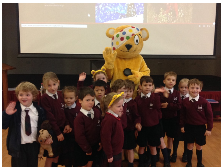
Children In Need, 2014