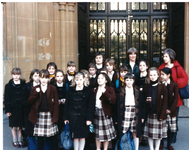
Trip to London, late 1980s