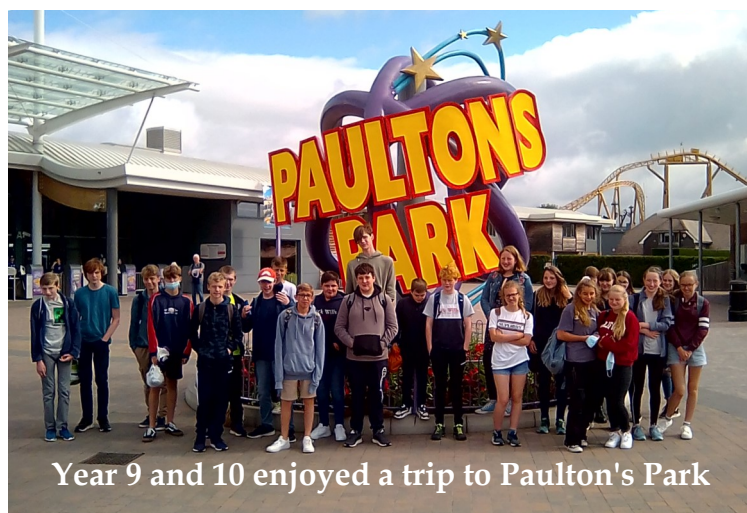
Year 9 and 10 enjoyed a trip to Paulton's Park